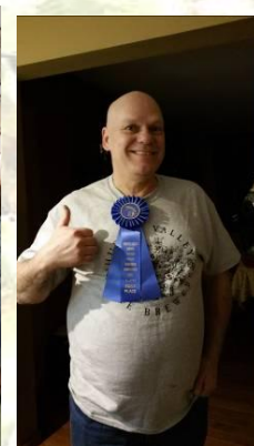
First prize to President