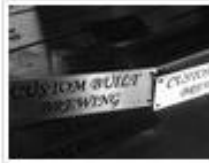
Custom Built Brewing