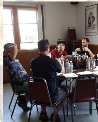
Stouts and Porters