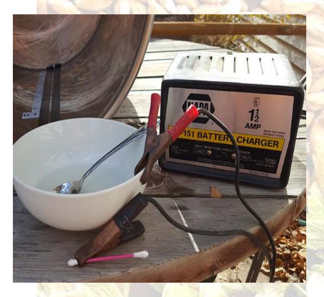
About to etch using cotton swab

DC power (from a battery) 1/4 cup vinegar Cotton swabs Electrical tape and vinyl stencils Level Measuring cups Latex gloves Alcohol wipes X-Acto knife Bar Keepers Friend cleaner