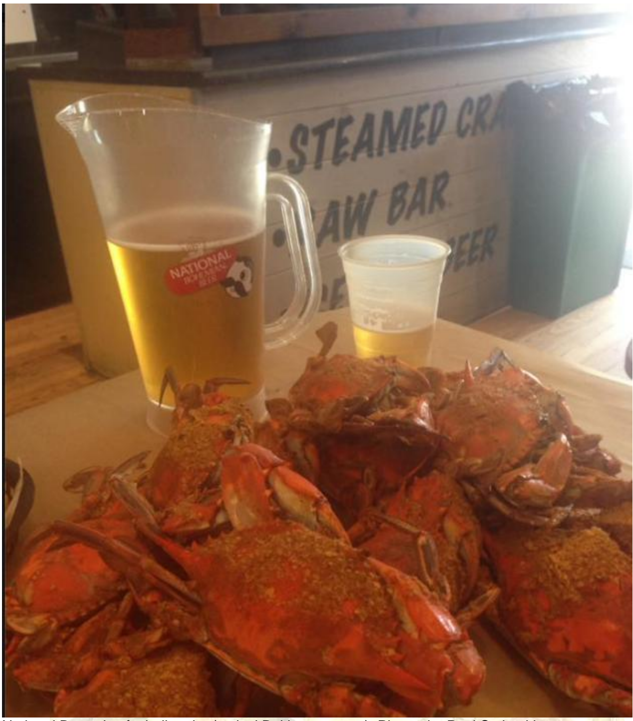
National Bo and soft shell crabs (typical Baltimore treats)