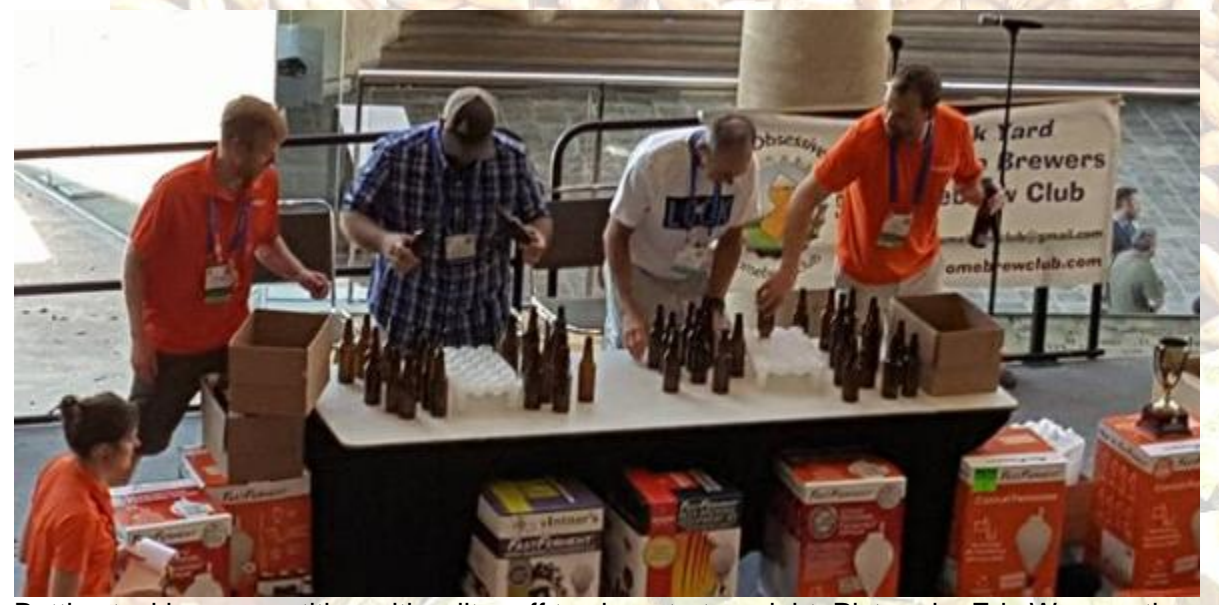
Bottle stacking competition with editor off to slow start on right