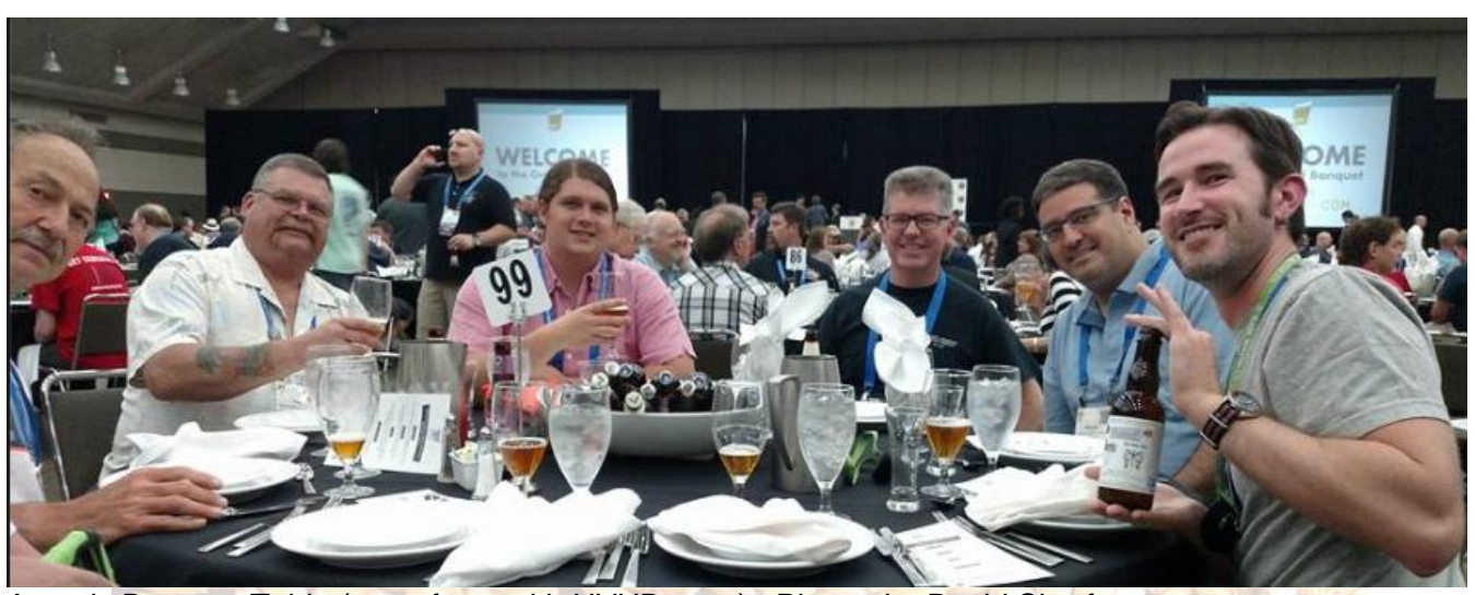
Awards Banquet Table (one of two with HVHB guys)