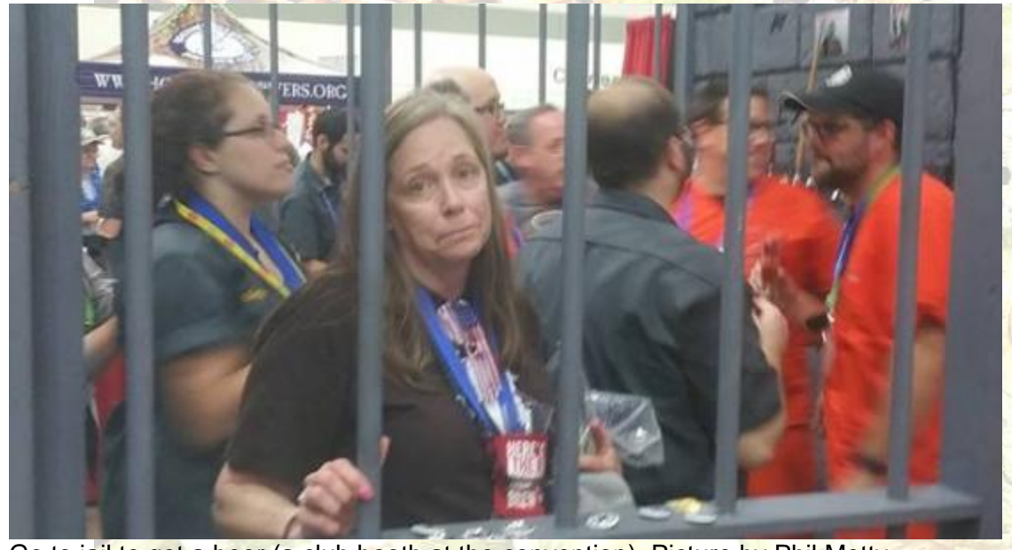
Go to jail to get a beer (a club booth at the convention)