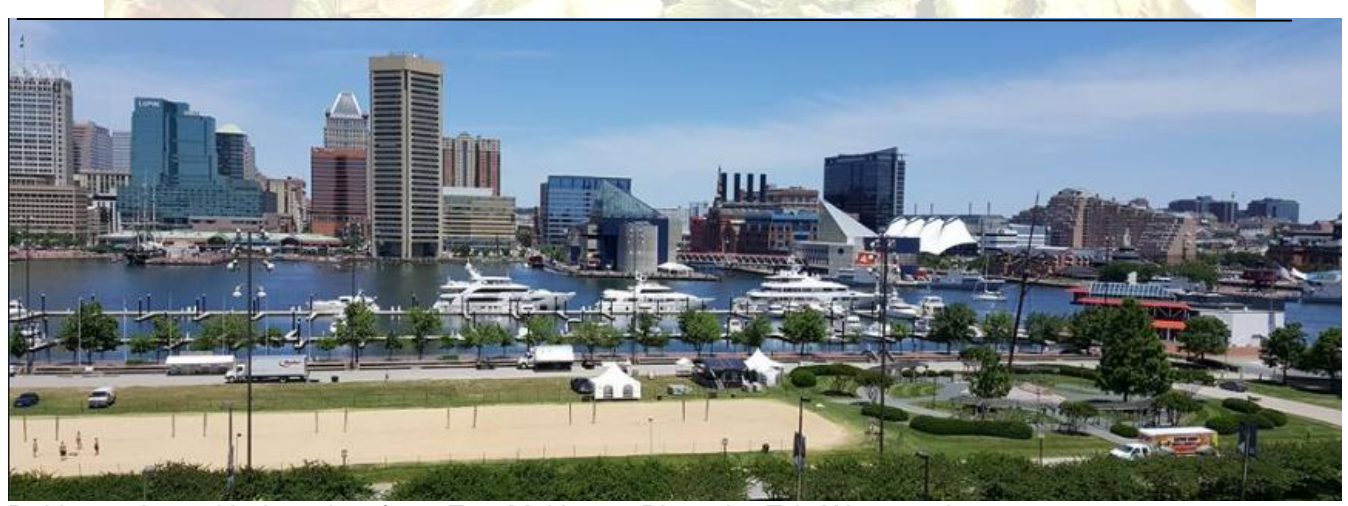
Baltimore Inner Harbor view from Fort McHenry

Tags: standard-strength, pale-color, bottom-fermented, lagered, central-europe, traditional-style, pale-lager-family, malty