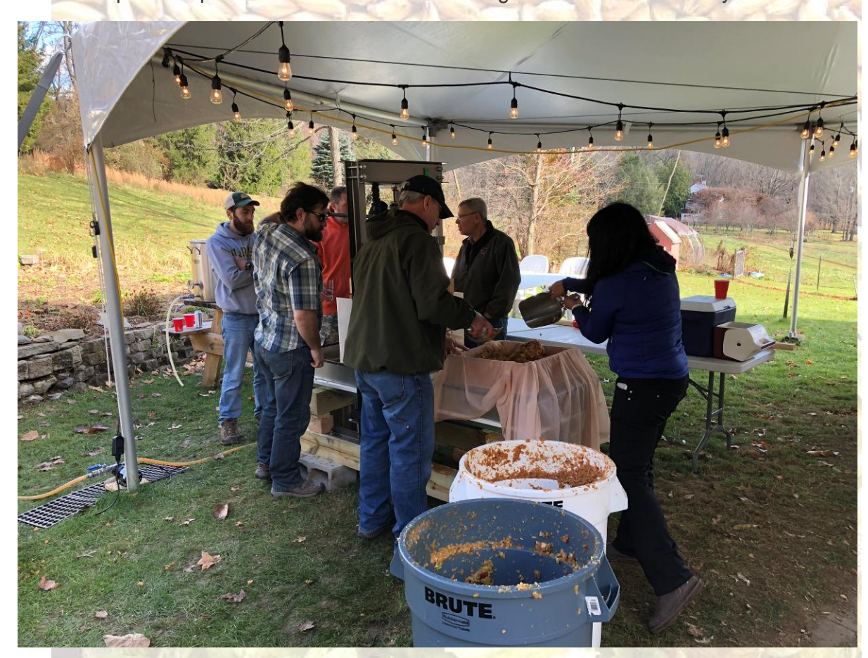
Inside the tent -- pressing on the left and setting up a stack on the right