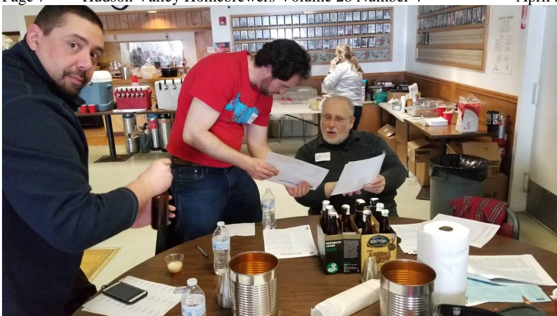
Checking strong ale evaluation sheets