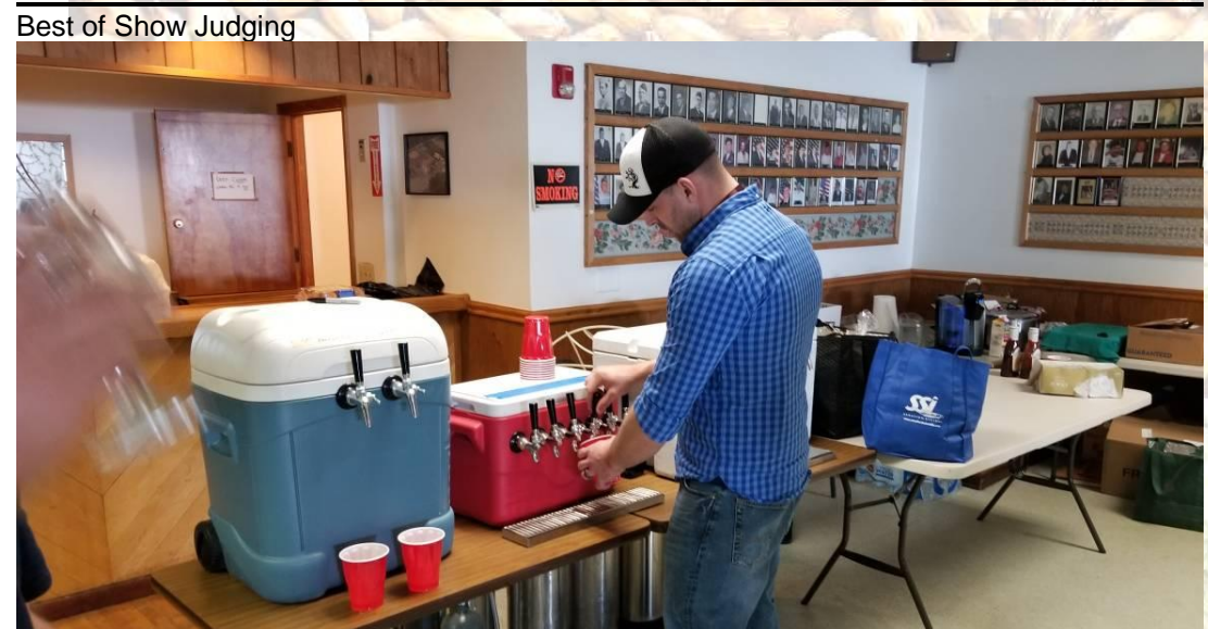
Testing beers brought in for lunch