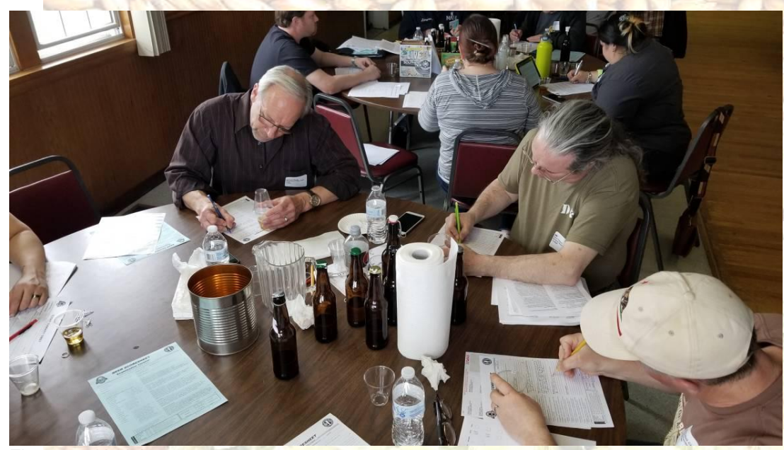
First round judging