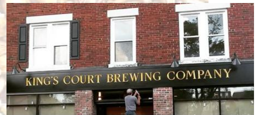
King's Court Brewing Company